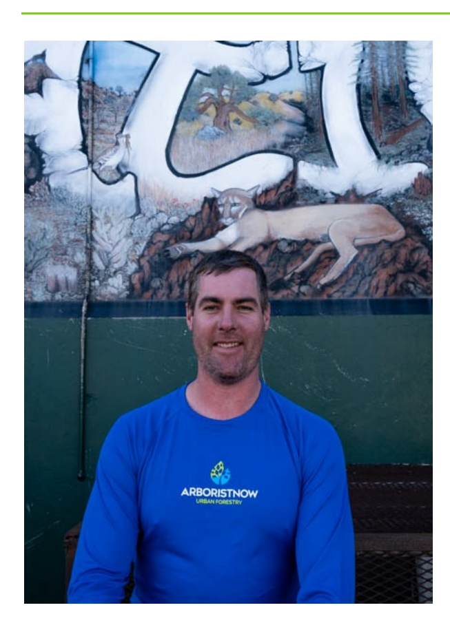
It's been nice gnawing you!