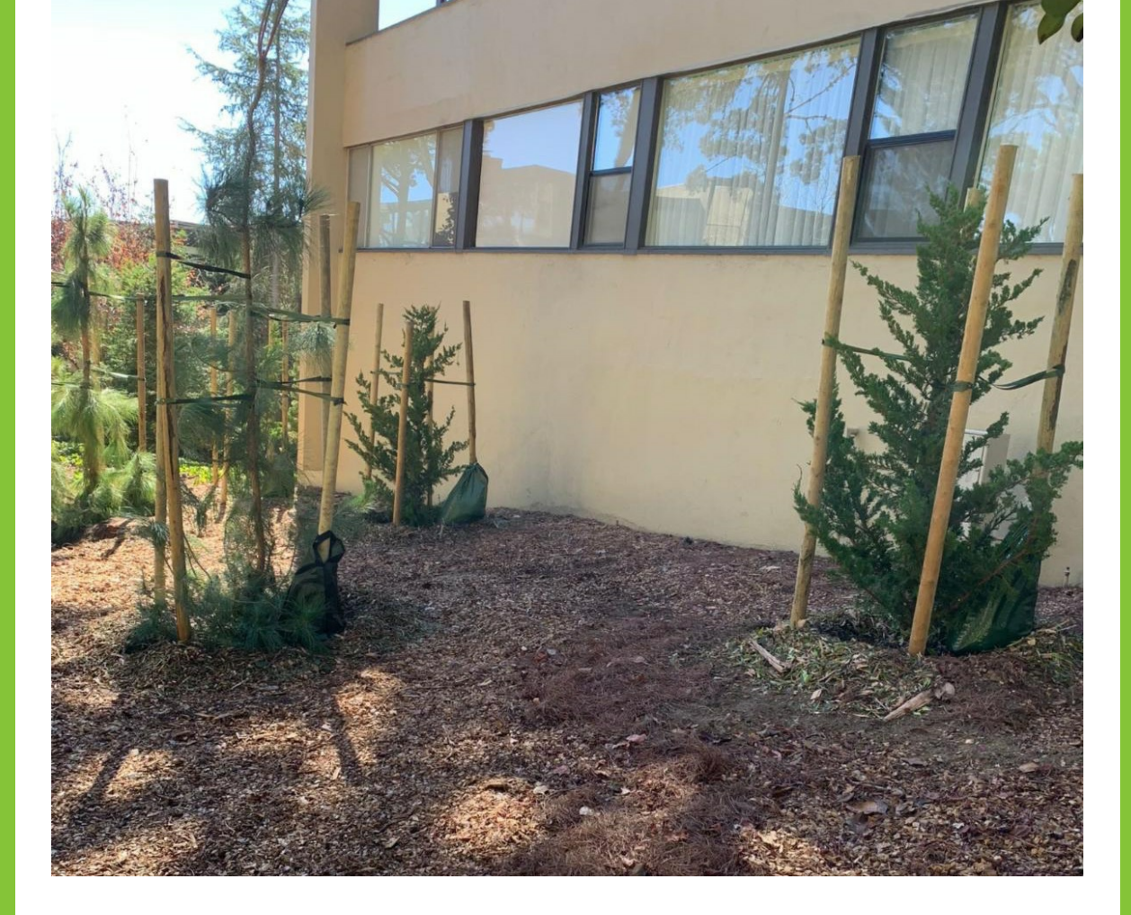
Project highlight: Planting 24" box Pinus canariensis and 15gal Juniperus chinensis for Laguna Heights HOA reforesting project in replacement of ailing Pinus radiata.