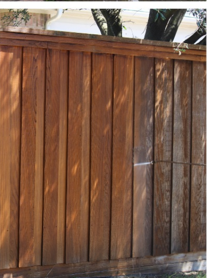
Pruning, irrigation, wintertime color, fence repair and more!

San Francisco's rainy season doesn't mean your landscape goes completely dormant. Take advantage of the cool weather to prep your yard for a verdant spring awakening.